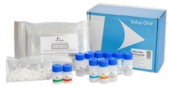
Solus One Salmonella

Use Solus One Salmonella to test the most challenging matrices using simple enrichment protocol variations.